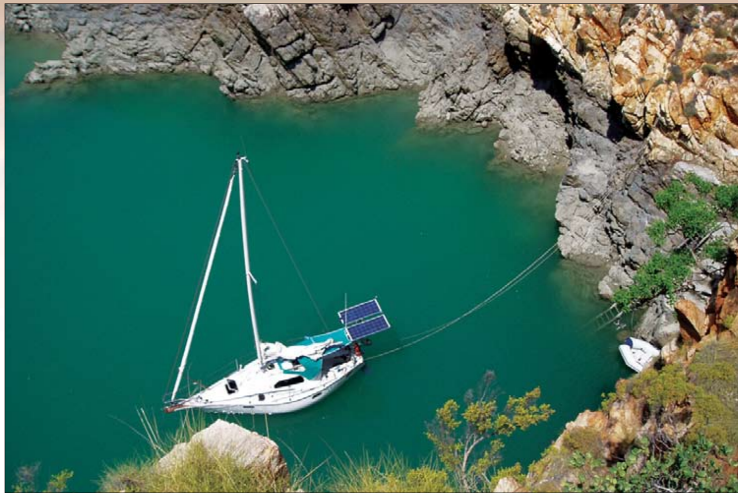
The compact little Yanmar 1GM10C clocked up over 600 hours in Velella, as she sailed north from Perth and up over the top of Australia and down to Cairns.