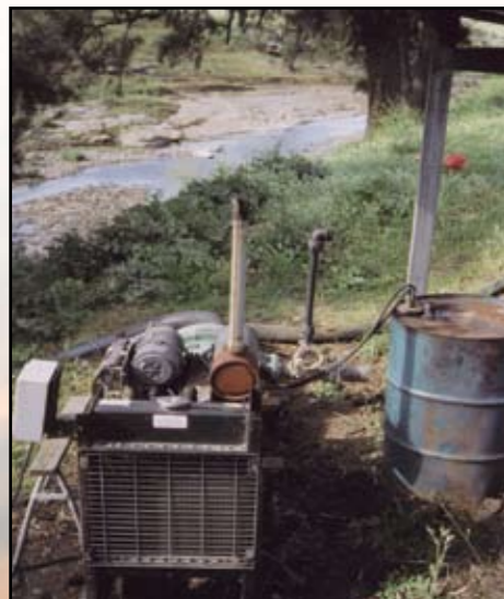
Wybong Creek feeds the Carrigan's Upper Hunter Valley property

Fuel consumption is a very respectable 6.5 litres per hour at 1800rpm and is producing an easy 50 HP continuous. The engine and pump set is now approaching the 3000hr mark with the only maintenance, apart from a new fan belt, being new oil, coolant and filter replacement at the correct service intervals.