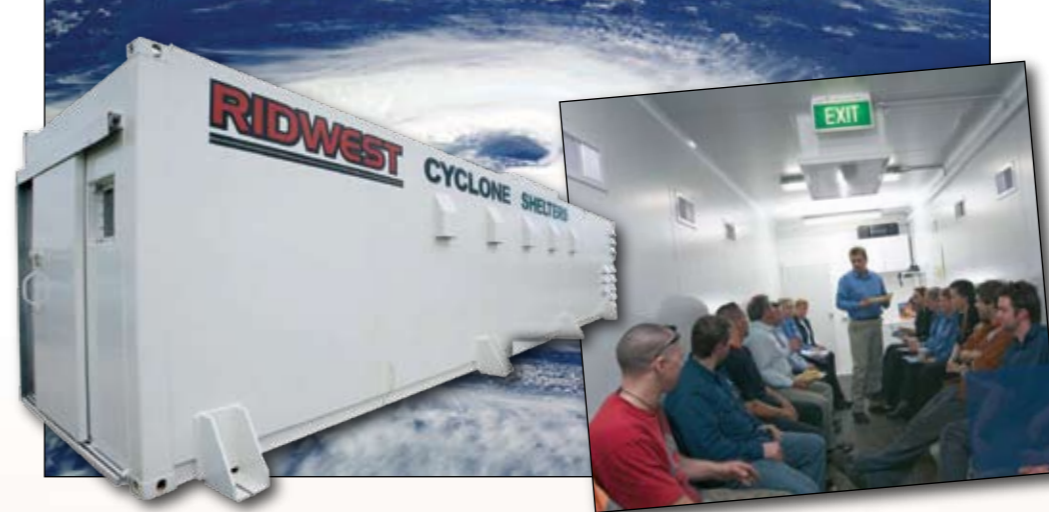
A Yanmar powered YEG generator set was chosen to provide sustainable power for the Ridwest Cyclone shelter. The Ridwest shelter can accommodate up to 35 people

Enterprising WA based engineering firm, Ridwest Engineering, has launched the first of their new Cyclone Shelters that feature YEG generators for stand alone electricity needs.