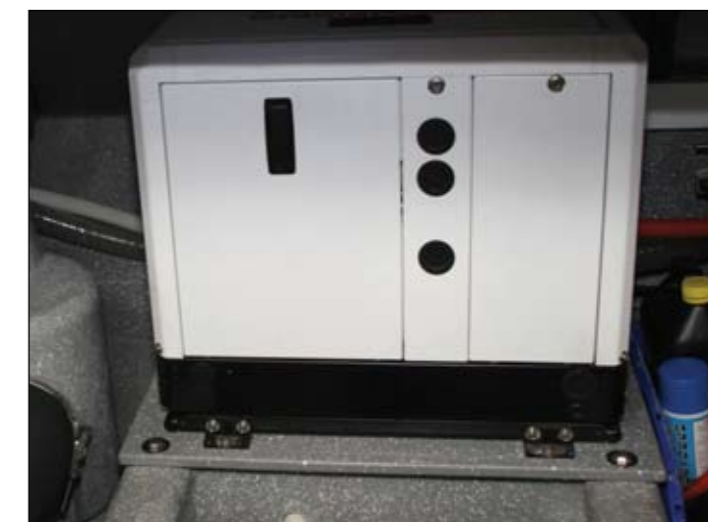
MASE IS 3.5 generator