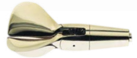
The 3 Blade Gori Folding propeller

For further information please visit: www.martenyachts.com