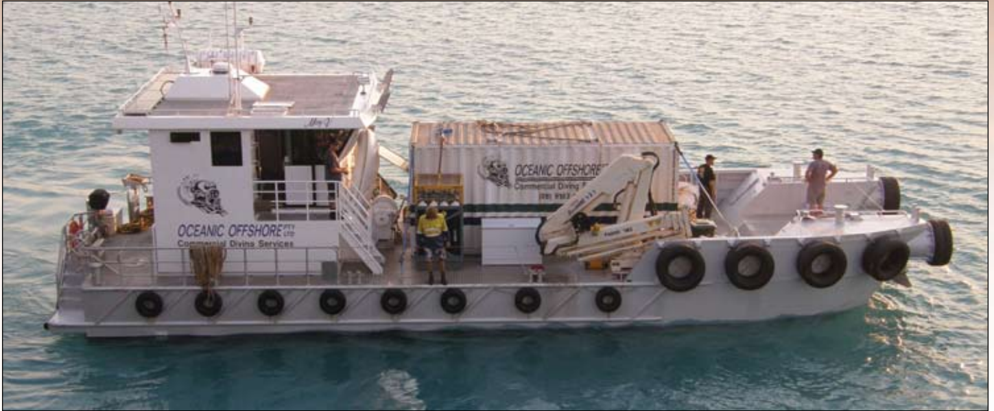
Oceanic Offshore's purpose-built commercial diving vessel features an onboard decompression chamber