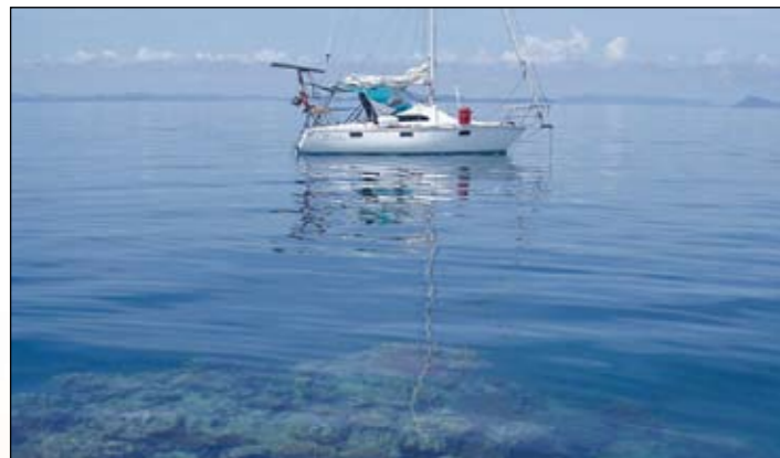
Velella anchored on Boulder Reef in North Queensland