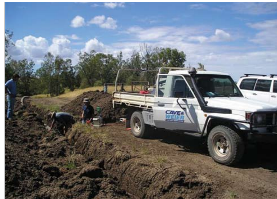
Over 5 kilometers of trenches were excavated to house enough pipe to supply bore water to 10,000 head of cattle