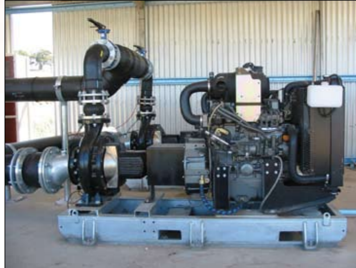
Each Yanmar 4TNE delivers a max output of 68hp from a direct injected, 3.3 litre 4 cylinder

Graetz Irrigation are located at Nuraip Rd Nuriootpa SA. Telephone 08 8562 1333.