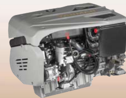
Yanmar 6BY Shaft Drive

For further information please visit: www.scimitarmarine.com.au