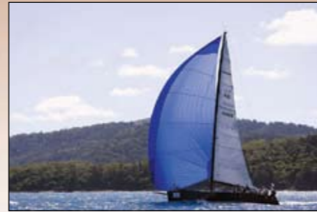
The stunning Marten 49 showing her wares during the Hamilton Island Race Week

Nothing could compliment the Marten 49 better than the magnificent location of Hamilton Island and the crisp clear waters of the Whitsundays. After making her Trans Tasman cross, the Marten 49 'Carrera' became one of the star attractions at Hamilton Island Race Week. Blending her unmatched style with her dynamic performance, Carrera drew the attention of competitors on the water and magnetized a crowd of viewers at her berth – she was truly one of a kind. By combining the talents of designers Reichel/Pugh, SP Technologies design engineers and the experience of Marten Yachts, a yacht of outstanding pedigree has been created.