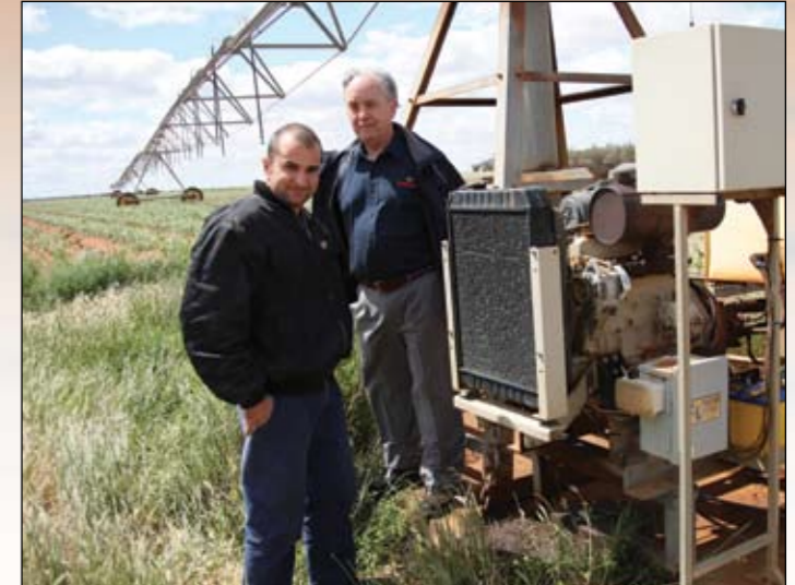
Yanmar's 4TNE going strong after 15,000 hours