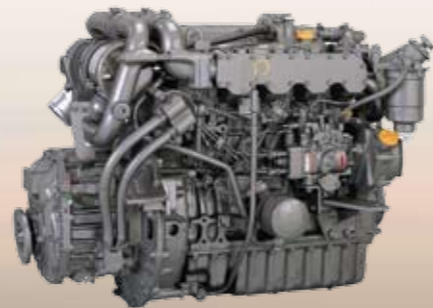
Yanmar 4JH3-DTE turbo diesel engine

For further information please visit: www.steber.com.au