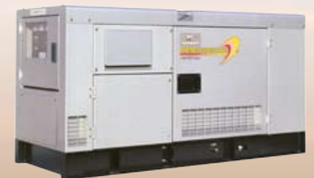
Yanmar YEG Generator

"As well as the obvious mining industry category, we think our Cyclone Shelters will be valuable for Defence Dept personnel, remote education and health facilities, drilling exploration teams and probably several others too. So we intend to build to special client specifications so all uses can be met, rather than just the 'standard model' and size", he commented.