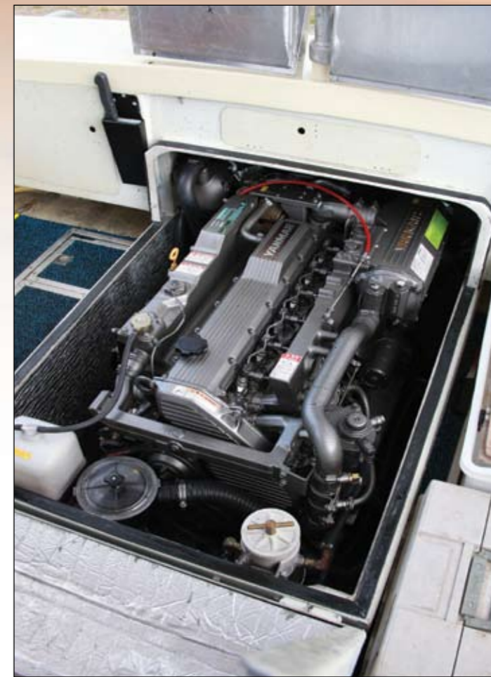
Yanmar 6LPA-DTZP marine diesel engine