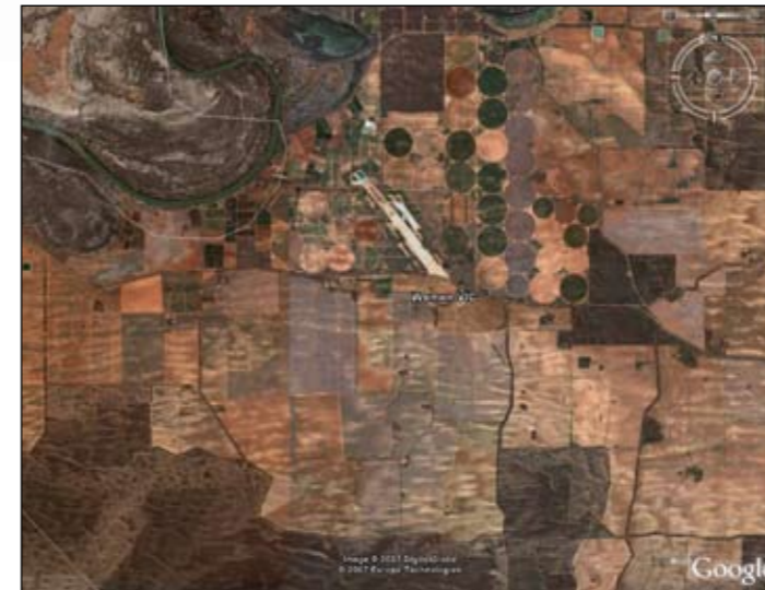
Wemen, Victoria