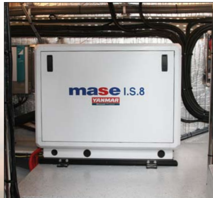
The Yanmar powered MASE IS 8 generator

For further information please visit: www.steber.com.au