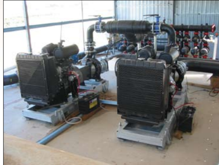
The twin Yanmar's are rigged to drive Davey ISO pumps to help protect the Tilbrook family vines