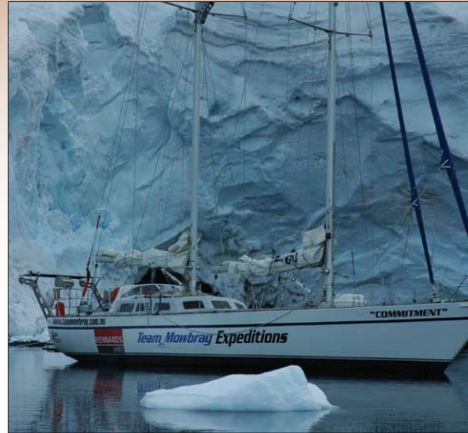
Guests are encouraged to become a part of the team