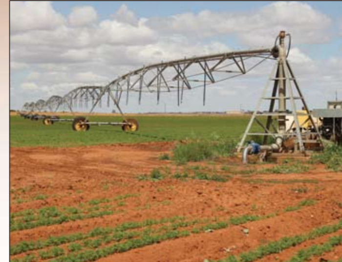
The Lamattina carrot production encompasses 2430 Ha with 62 Yanmar powered irrigators on site to help produce up to 500 tonnes of carrots per week for customers across Australia