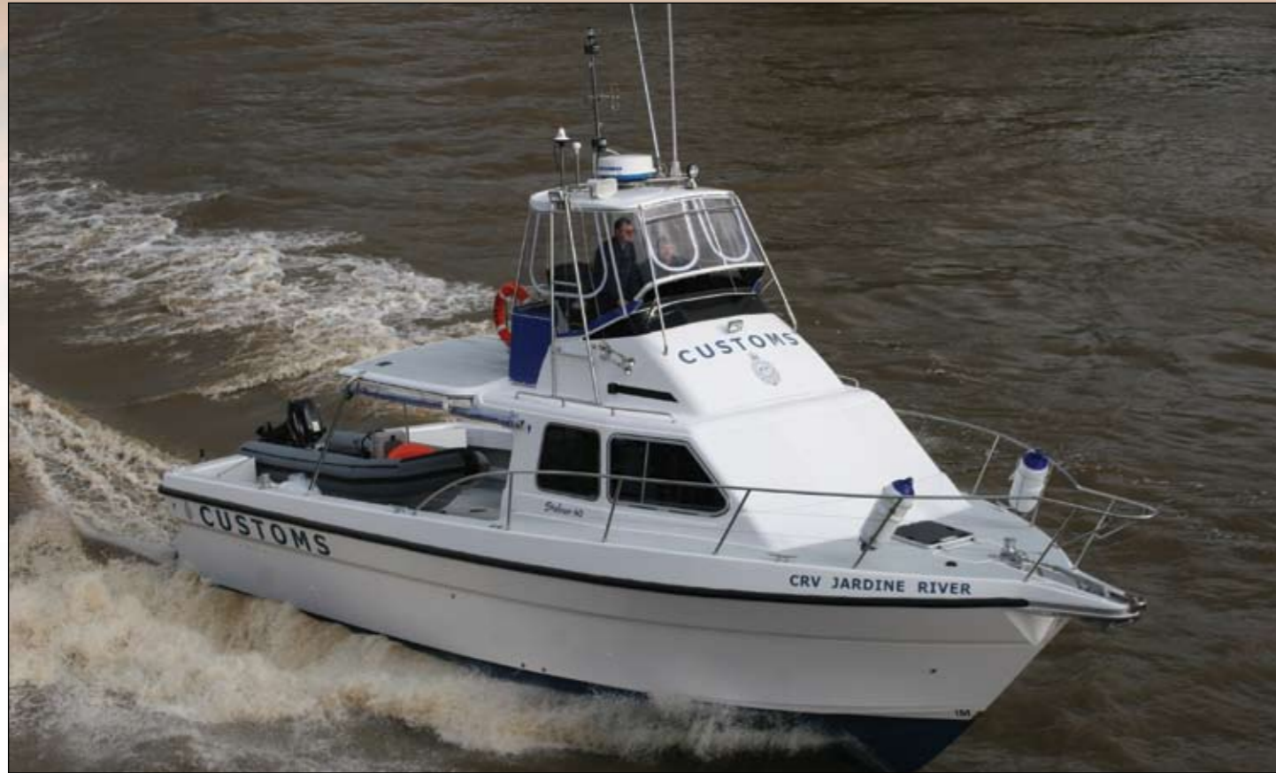
Steber and Yanmar make a powerful boating combination

Steber and Yanmar have combined forces to supply the Australian Customs Service (ACS) with four patrol boats to assist in the border protection of Northern Australia. The vast northern coastline demands reliability and rapid response times from both the Customs crew and the Steber vessels.