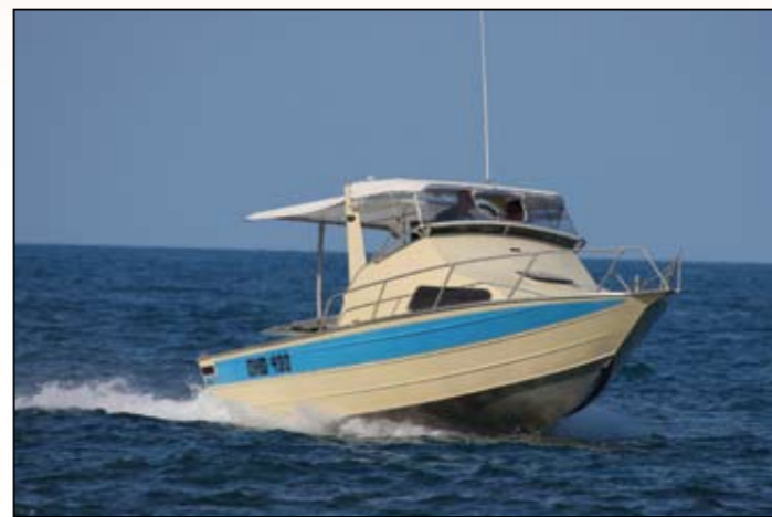
Less than 1 litre per Nautical Mile is very economical boating