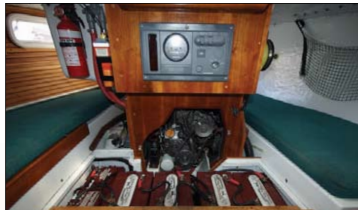
The Yanmar 1GM10C engine neatly installed in Velella

One of Yanmar's pocket rocket saildrive engines, the 1GM10C, has clocked up some of the most incredibly scenic yachting hours onboard the cruising sloop 'Velella' as she embarked on a voyage from Perth, up around the coast of northern Australia and down to Cairns.